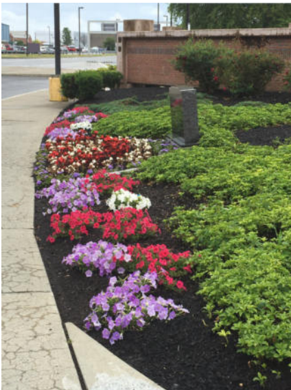
Albany International Airport Don Wrieden – Chairman

We had a good run... We started our Adopt A Highway program back in 1994 by building a raised bed out of Hemlock and lots of rebar. Ten years later in 2004 - we built a raised bed that would last a lifetime. Unfortunately when construction started on the Exit 7 bridge off of I-90 our concrete base, block structure, soil and flower bulbs mysteriously disappeared leaving only the steel we drove down 5 feet to keep the Very thick concrete base from heaving.. Ken Abele during construction of our second raised bed on I-90 at Exit 7 Westbound. Built to last This was build as a Memorial to an outstanding member - Mr. Conrad (Connie) Robert . This project took years to get State and Federal approvals and lots of hard work from members of the Garden Club of Albany. ps. If you know who borrowed our several thousand pound raised bed - please ask them to return it . Perhaps someone with big boy toys on site while working on the bridge knows. Thanks!!! Built to last... Destroyed in hours