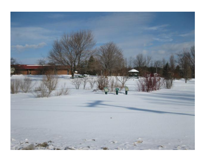
A Blast from the Past