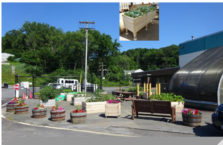
Greenhouse and raised beds at the Center For Disability Services 700 S. Pearl St.

If you have free time on Wednesday mornings – you could consider helping us out – I bet it will do as much good for you as it does for the individuals. – Contact anyone of our volunteers to find out more.